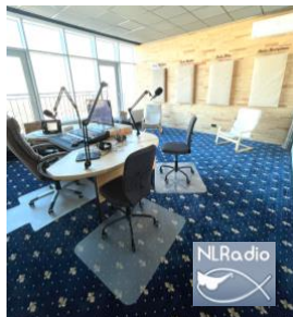
Studio A: Russian

An exciting year of transition and opportunity culminated in the New Year's Eve 2026 initial broadcasts of NLR's Russian and Ukrainian radio networks! In this edition we review the timeline.