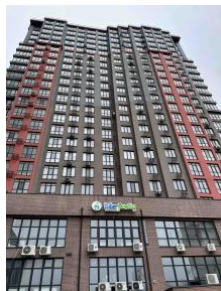
Studios in the sky