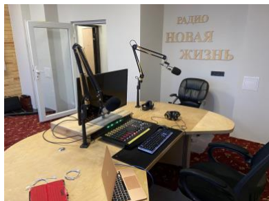
Studio B: Ukrainian